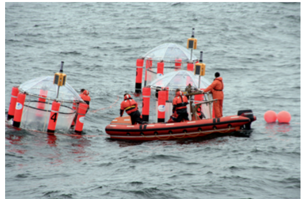
Study of ocean acidification in offshore mesocosm CO 2 perturbation experiments.

The effect of ocean acidification on the global economy will depend on adaptations of the marine ecosystem as well as on human adaptation policies. Both are difficult to anticipate, making it difficult to calculate economic impact. A collaboration of natural and social sciences is required to research the potential for adaptation in both ecosystems and human systems, and the interplay between the two. The costs of adapting to ocean acidification need to be assessed.