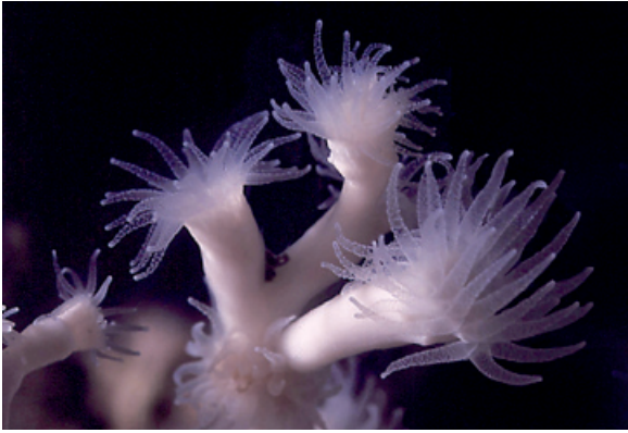
Lophelia pertusa – a cold-water reef-forming coral that lives in deeper water — is widespread across all oceans and, with other calcareous organisms, is threatened by ocean acidification.