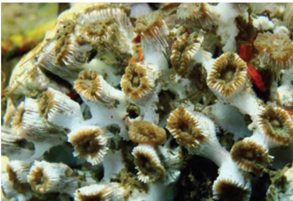
Endemic Mediterranean coral Cladocora caespitosa showing severe skeletal damage and dissolution due to ocean acidification.