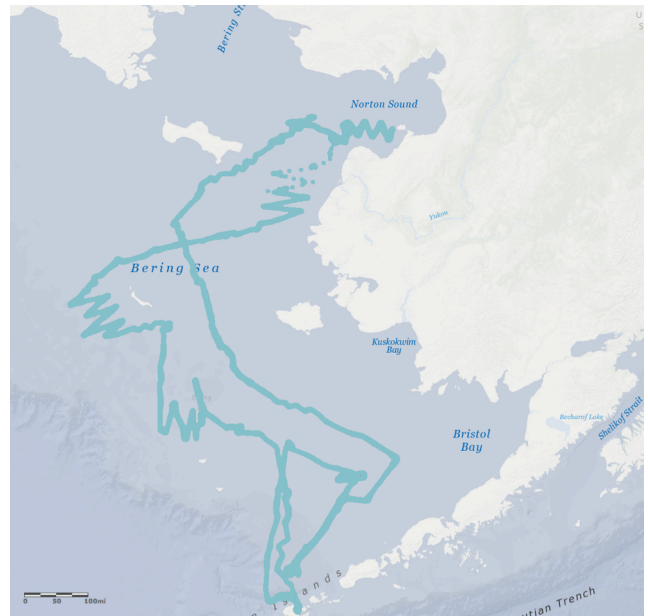
Fig. 2. SD-128 Track through Bering Sea during the 2015 Surface Mapping Mission.

advantage of the SAILDRONE is its speed, endurance, and maneuverability, which allow launch and recovery from shore and enable extended research missions, an important capability gap in current unmanned surface vehicles and a critical mission capability for Arctic research and monitoring.