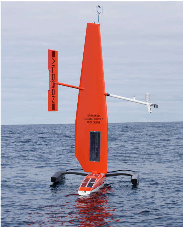
Fig. 1. SAILDRONE SD-128 during the 2015 Bering Sea Surface Mapping mission.

During 2015, NOAA OAR Laboratories and the ITAE program worked with SAILDRONE, Inc. under a Cooperative Research and Development agreement to develop the SAILDRONE platform for high-latitude research purposes. The primary