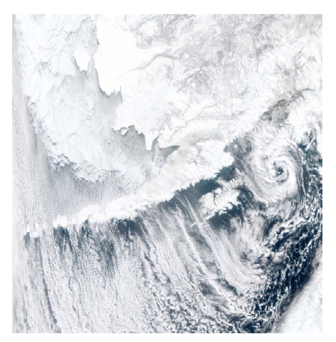
Fig. 1 Satellite image of Bering Sea and Gulf of Alaska (March 19, 2008). Extensive ice is evident over the Bering Sea shelf. Winds out of the north continued to push the ice farther south in March and substantial portions of the southern shelf were covered in May.