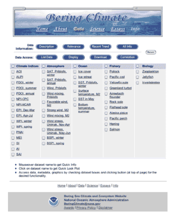
Fig. 2 Bering Climate Page. Web page of check boxes and buttons that allow users to examine recent trends in climate, atmospheric, oceanographic, biological, and fisheries data.

NOAA's Pacific Marine Environmental Laboratory (PMEL) hosts a unique and valuable resource for scientists working in the Bering Sea. The Bering Climate Page (http://www.beringclimate.noaa.gov) provides data and a variety of tools to investigate climate-ecosystem coupling in the Bering Sea (Fig. 2). Created by Drs. James Overland and Sergey Rodionov (U.S.A.), the page contains: a brief overview on current status of the Bering Sea, a quick look at over 25 indices of climate and ecosystem status, links to web accessible scientific reports, essays by topic experts, and perhaps the most valuable feature for researchers, a data page that provides access to climate, atmospheric, oceanic, biological, and fisheries data time series. Each time series is described and its relevance as an index or metric is explained. Users can examine recent trends in each individual index (look at the new regime shift calculator) as well as calculate correlations between indices. The web page is easy to use and a great way to generate hypotheses after looking at data.